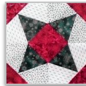
March Milkmaid's Star