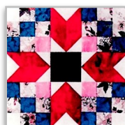
April Good Cheer