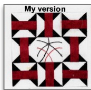
October Beggar's Block