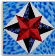
February Mariner's Compass