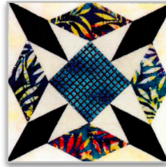
From Best Blocks