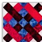
June Red Cross Quilt