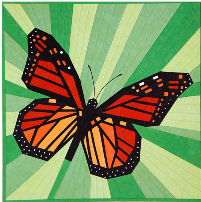
Monarch quilt by Sherrill Ash

They cluster together on pine, cypress and eucalyptus trees in the Monarch Grove Sanctuary , 250 Ridge Road, Pacific Grove, CA. The pgmuseum.org is a good source of information about all things Monarch.