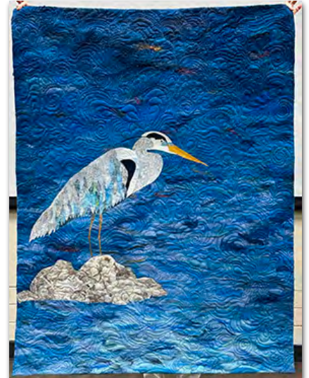
Three quilts by Alice Stoll