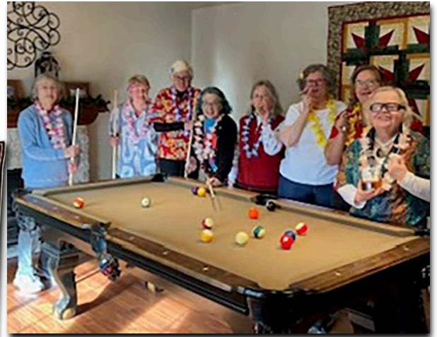
Above: Material Girls 2023 Hawaiian Christmas Party Left: Material Girls' Quilts by the Bay Silent Auction Quilt

quilters' individual works. Those works often inspire our group quilts.