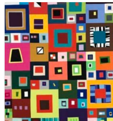
Quilts by Lorraine Woodruff-Long