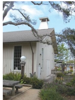
Above: Photograph courtesy of Cedar Street Times

"Quilts by the Bay," the 35th Monterey Peninsula Quilters Guild Quilt Show, will be held the weekend of April 5 and 6* in historic Chautauqua Hall in downtown Pacific Grove. The show runs in conjunction with Pacific Grove's Good Old Days festivities along Lighthouse Avenue.