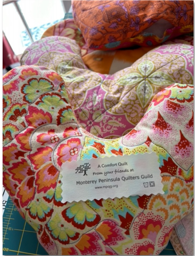
Heart pillows