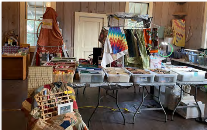
Photo of the May 2023 Fabric sale.