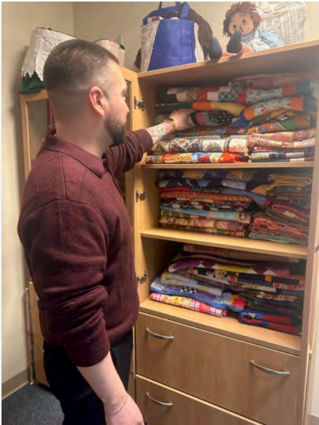
A CASA Advocate picks out a quilt for his new teen.