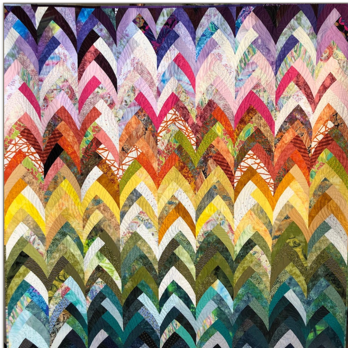
Color Wheel Cascade Susan Riddoch