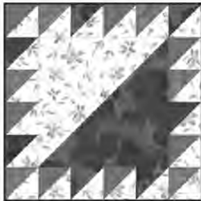
Holly Casey Quilts