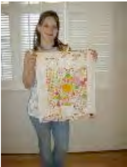
National Charity League