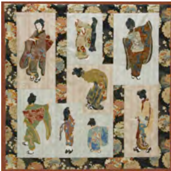
2008 Opportunity Quilt

Opportunity Quilt tickets are available from Cheryl Smith dacherpwd@gmail.com or 831.484.8010.