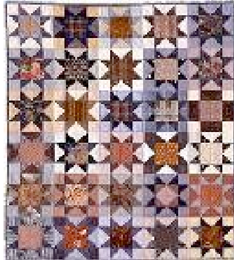
January: Roberta Horton's Pieced & Patched Stars

Arc-I-Texture and Sensuous Lines & Curves